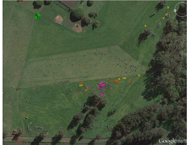
Figure 8. The spatial pattern of goats (dark and light green squares), and sheep (purple squares) that were not bonded to cattle (orange squares) plotted on a Google Earth image from the Haleakala Ranch, Maui, HI between 0800 and 0900 hours on April 24, 2014. Note the goats, bunched in the top left corner, remained separated from the other animals for the majority of the period as observed by the ranch manager.

The data downloaded from the GPS collars included latitude and longitude, providing animal locations on the landscape that were synched in time for both bonded and non-bonded groups. Square meters occupied by each of the two groups were recorded using the maximum