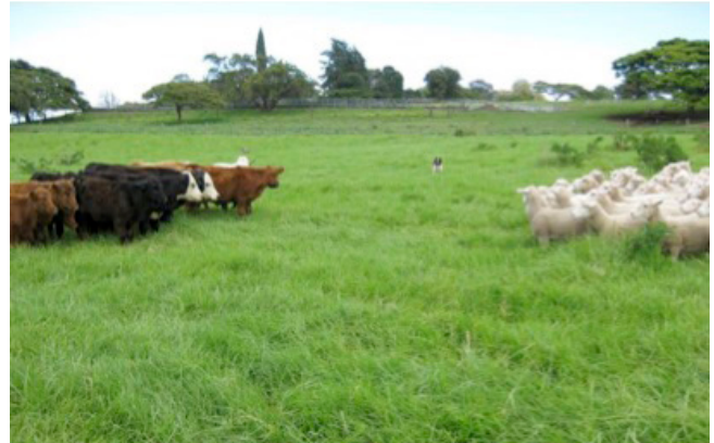
Figure 5. Border collie and Kelpie herding dogs were used to bunch and move the tightly formed flerd composed of sheep and goats bonded to cattle and move them through a gate in seconds (left). Non-bonded sheep avoid forming a group with cattle; therefore, each intraspecific group had to be moved separately through the gate into the new paddock (right), a process that required more time.