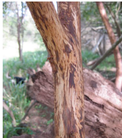
Figure 2. An example of leveraging differences in foraging behavior: a Big Island Ranch uses goats to control woody species like Christmas berry ( Schinus terebinthifolius ) (left) in a paddock used primarily for cattle. After browsing all the leaves in their reach, the goats proceed to debark the trees (right).