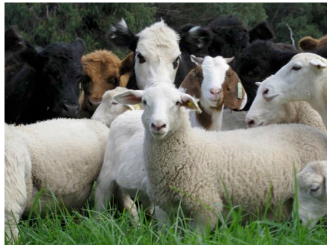
Figure 1. A “flerd” of cattle, white-faced sheep, and meat goats at Haleakala Ranch, Maui, HI, where interspecies social bonds have been formed to make management of multi-species stocking more efficient.

Ranching is a challenging profession worldwide, and Hawai'i is no exception. Hawai'i's ranchers and land managers must juggle extreme variation in rainfall,