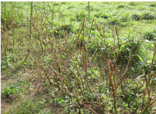
Figure 3. A patch of apple of Sodom ( Solanum linnaeanum ) decimated by goats.

Soon after sheep were introduced onto the USDA Agricultural Research Service’s Jornada Experimental Range (USDA-ARS, JER) in 1983, it became apparent that coyote predation would have to be addressed. Managers implemented a number of approaches including guard dogs, trapping, use of poisoned bait, and gunning from aircraft. To this mix of approaches researchers introduced bonding of small ruminants with cattle to create flerds. Overall, flerds reduced coyote predation among the small ruminants, especially when the sheep broke into more groups than the number of available guard dogs, because the sheep always remained in the presence of one or more cattle (Figure 5). This not only provided the small ruminants protection from coyotes but also reduced the time required to locate the small ruminants on brush-infested landscapes. The use of flerds also controlled the movement of small ruminants without the need for net wire fencing as long as the fencing was adequate to control the cattle, and it distributed foraging of the small ruminants over more of the landscape than was the case with flocks of non-bonded sheep.