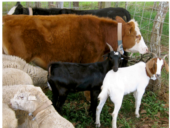
Figure 6. Two heifers, two goats, and two sheep from within a bonded herd were collared with GPS collars to study paddock use for a period of two weeks in December to January 2013–2014. A sub-group from a non-bonded herd were similarly collared for a two-week period in April to May 2014.

The bonds appear to endure over time, even after three months of separation between bonded cattle and