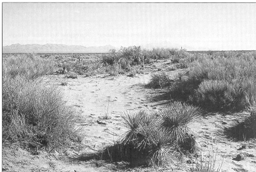
Figure 3. A landscape dominated by mesquite ( Prosopis glandulosa ) represents an alternate stable state over the indigenous grasslands in the Jornada Rangelands of the southwestern United States.

become major problems (Regier and Hartman 1973). For example, the sea lamprey has, through predation, taken a heavy toll on the native benthic fish community, including lake trout ( Salvelinus namaycush ), lake whitefish ( Coregonus clupeaformis ), and burbot ( Lota lota ).