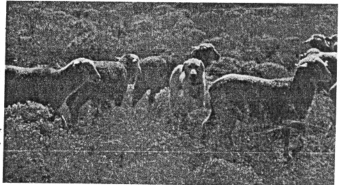
Princess with Rambouillet sheep on the Jornada Experimental range. Socialization of sheep to dog and cohabitation is critical to the protection of sheep from coyote predation.

(Flock A). This (socialization) was done so that the sheep would learn to tolerate the close association of the dog and not scatter. After 6 days the sheep were divided into 2 groups