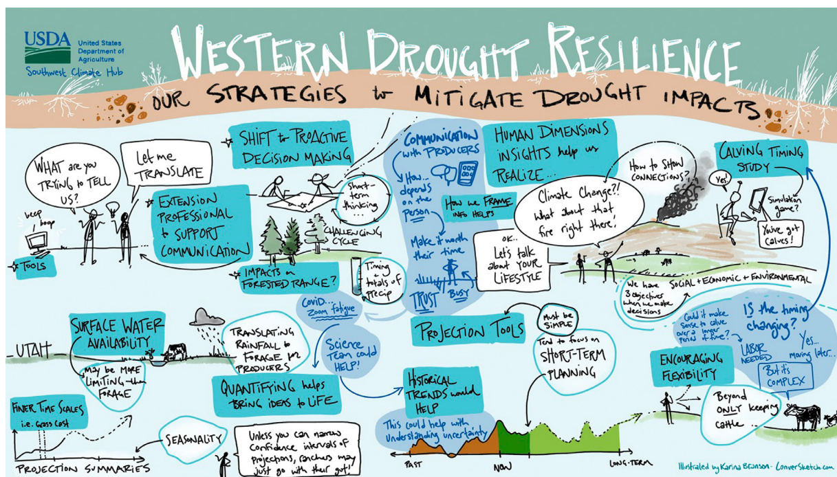
Figure 3. Group discussion captured by graphic illustrator present at the workshop (Karina Branson, ConverSketch).

included examining an inclusive suite of different climate projections, 20-22 as well as quantifying the degree and duration (i.e., exposure) of past and future drought. 23-25 We then presented our results by region to highlight the diversity in drought manifestation. We explained that while temperature is likely to increase across all regions, precipitation and soil moisture display more variability. For instance, we described the northern mixed prairies and cold deserts of the western United States (Fig. 2) will experience an increase in winter and spring soil moisture, although relatively unchanged summer and fall soil moisture. In California’s annual rangeland region, we suggested more frequent extreme drought during the winter, but slightly wetter average spring and summer conditions. We explained that spring soil moisture is likely to decline in the hot deserts region, but differ in projections for soil moisture change for other seasons in both the hot deserts and shortgrass steppe.