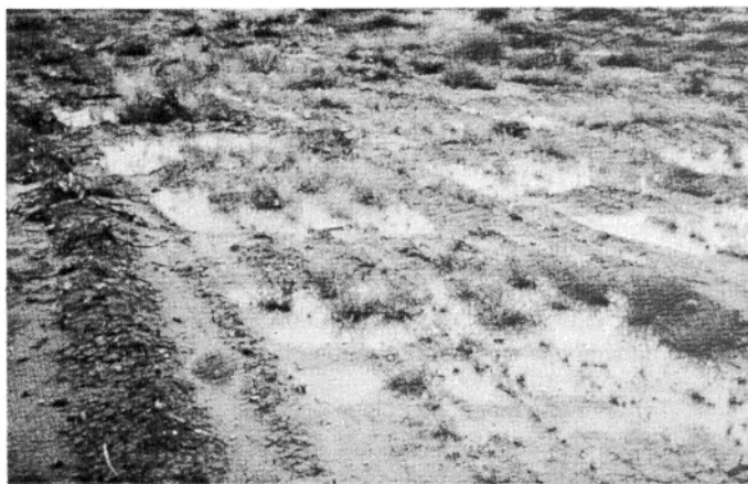
Fig. 1. Basin pits and seedlings 1 year following seeding. The photo was taken following a thunderstorm.

Various accessions and species were tested. Most seeds for these trials were furnished by the Los Lunas Plant Materials